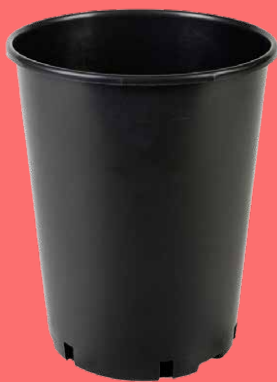
High Nursery Pot 18/L