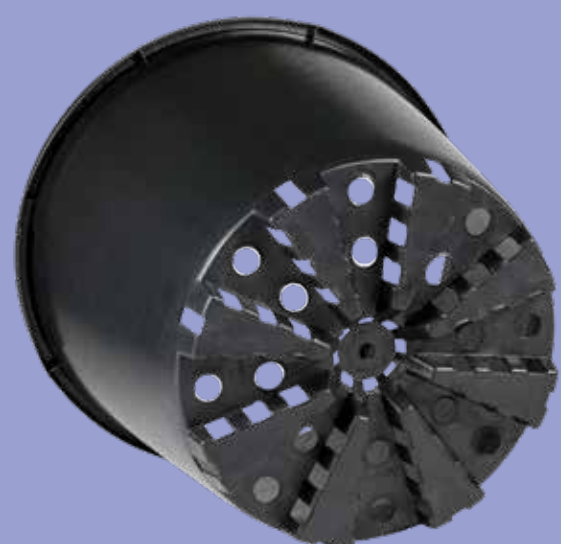
35/MR 25 lt.

Discover the Blueberry Bamaplast series and transform the cultivation of your blueberries! Imagine having full control over the water needs of your plants in every season and location. Thanks to the Blueberry pots, this is possible. The excellent drainage, ensured by the pots for the root system, prevents harmful water stagnation and inhibits the spread of pathogens from plant to plant, thus maximizing production. The advanced internal ventilation, thanks to the innovative bottom specially designed for this cultivation, ensures the right oxygenation of the roots and prevents water excesses. The bottom of the pot is raised from the ground, allowing the plant to breathe and facilitating drainage thanks to numerous drainage holes. With the Blueberry Bamaplast series, you have everything you need for your blueberries to flourish like never before.