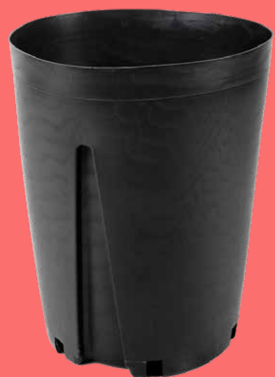
High Nursery Pot 20/L